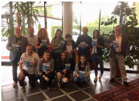
June 14th, 2018, final meeting in Graz

The project “DREAM: Dynamic Reinforcement for European Adaptation of Migrants” has the aim to reinforce the migrant integration provision through exchange of experience on priority integration areas and spread results of successful initiatives through a EU-wide network of stakeholders.